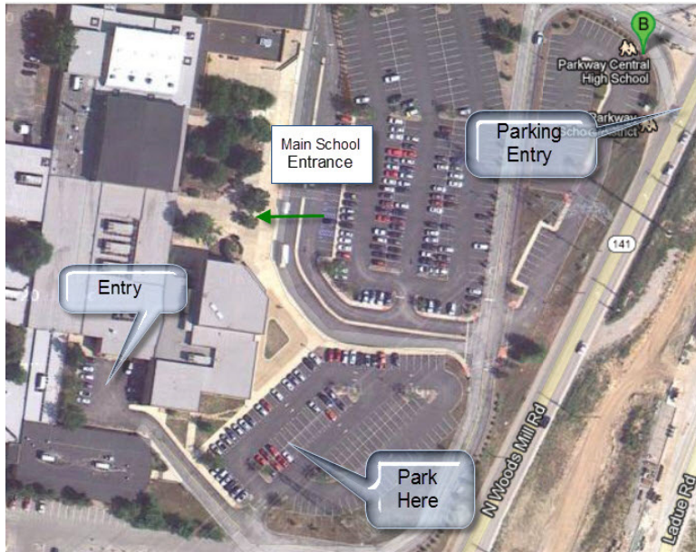
Figure 1: Regular monthly meetings; StampFest is at the North end of the building near the football stadium

Follow links on the webpage for information about other local clubs, shows, and maps to the shows.