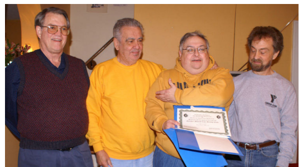
Figure 1: Merger 01/01/2007 - Constitution Ratified 08/24/2008

The awards were the finest available Squiggle Worms at Walgreen's given the Exhibits chair's limited time to find suitable trinkets. Our judge this year was Al Kugel of Chicago.