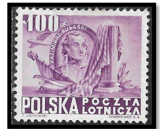
2. Poland, SC. #C26B, 1948

accepted by Washington or his commanders. At the Battle of Brandywine September 11, 1777, Pulaski proves himself to Washington by performing a tactic known as a rear-guard action which turns the battle around and in effect saved Washington's life. 2 days later Washington makes Pulaski a Brigadier General and puts in charge of all of Washington's calvary.