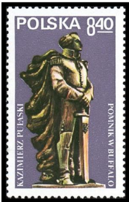
6. Poland, SC. #2357, 1979

In 2015, a second study funded by the Smithsonian Institution was begun. The combination of the skeleton having a number of typically female features (pelvis, facial structure, jaw angle) and that Pulaski had lived his