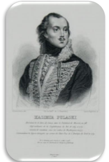
1. Engraving used for the #690

Many philatelists only know of General Casimir Pulaski from the only U.S. (Sc. #690) postage stamp, issued Jan. 16, 1931 which was the first stamp commemorating him. However, the story of Gen. Pulaski has become much more since the unearthing his remains in Savannah, GA in 1996.