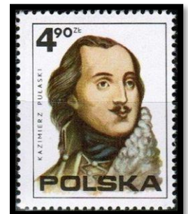
8. Poland, Sc. #2122c, 1975

The mystery of Pulaski's remains has now been solved. While unusual, it will not change the historical facts that Pulaski was a Polish and American war hero, outstanding horseman and exceptional military leader who fought valiantly for the independence and freedom of both Poland and the United States.