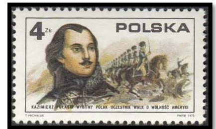
7. Poland, SC. #2120, 1975

life as a man, led researchers to the hypothesis that Pulaski may have been female or intersex (formerly referred as a hermaphrodite). The Smithsonian study hypothesized that the intersex condition could have been caused by congenital adrenal hyperplasia, where a female fetus is exposed to a high level of male hormone (testosterone) in the womb causing the development of partial male genitals. This is very likely the debility that was noted in his birth record and his having been baptized at home. Released in 2019, the results of this study concluded from the mitochondrial DNA of his grandniece, known injuries, and physical characteristics that the skeletal remains are certainly that of Pulaski.