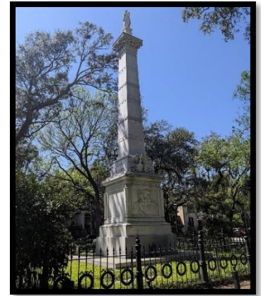
5. Pulaski Monument, Savannah, GA

In 1996, during the restoration of the Pulaski Monument the remains were exhumed and a forensic study is performed to confirm they are that of Casimir Pulaski. During the study the anthropologist determine that the remains were characteristically female as the forehead, cheek bones and pelvis are that of a woman. The eight-year examination of the remains proved inconclusive, although the skeleton was consistent with Pulaski's age and occupation as were several other skeletal injuries consistent with historical records of Pulaski's battle injuries. In 2005, the remains were reinterred in a public ceremony with full military honors, including Pulaski's induction into the Georgia Military Hall of Fame. A unique honor was bestowed on Casimir Pulaski in 2009 when he became only one of eight people to have been awarded honorary United States citizenship.