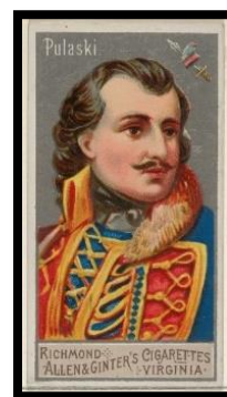
10. Tobacco Card