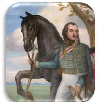
11. General Casimir Pulaski