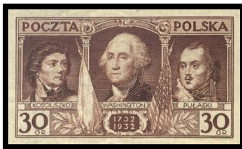
3. Poland, SC. #267, 1932

Casimir Pulaski was the second born son to a noble Polish family on March 6, 1745, in Warsaw, Poland. Records from his birth stated that had a debility that was not life threatening and which only becomes clear long after his death. Pulaski was small in stature and only 5' 4" tall. As a youth he excels at horsemanship. He was described as flamboyant, aggressive, brash, solitary, a loner, who never marries and has no descendants.