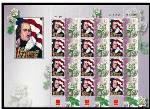
9. Israel, 2015