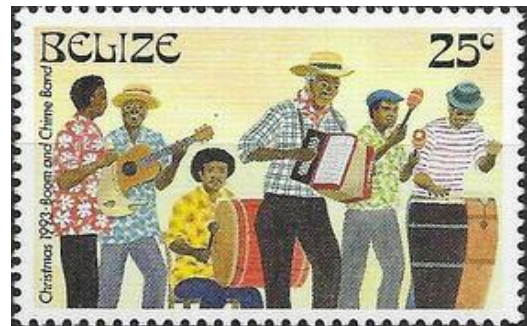
Figure 1. Belize, Scott # 1017 1

Few things are as exciting in the Morgan household as completing a topical collection of one, so you can imagine my sheer delight in finding just that while admiring my accordion stamp collection one morning!