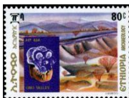
Figure 5. Ethiopian Stamp Scott # 826 5

While the jawbones of other animals are sometimes featured in philately, they most often represent paleontology such as this Ethiopian