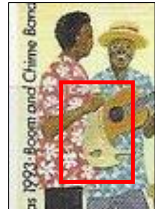
Figure 2. Left side of Belize stamp enlarged to show the quijada 1

donkey or ass, producing a powerful buzzing sound (Figure 3). To create the quijada, the "jawbone is cleaned of tissue and dried to make the teeth loose" 2 . It is then played by being held in one hand while the other hand strikes the bone with a stick, or drags the stick along the teeth, creating a scratching sound, Figure 4. 3