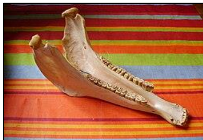
Figure 3. Quijada: a jawbone used as a musical instrument 2

A stamp from Belize, Scott #1017 issued November 19, 1993 (Figures 1 and 2) 1 , features an accordion player in the center, surrounded by other musicians playing maracas, drums, a guitar, and an unfamiliar instrument, the quijada (key-YAH-dah) or ass's jawbone. The quijada is an idiophone percussion instrument made from the jawbone of a