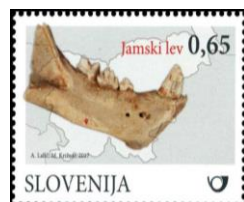
Figure 6. Solvenian Stamp Scott # 1213 6

stamp (Scott # 826) from 1978 showing a Hominid skull and jawbone 5 , or the Cave Lion jawbone shown on Slovenia's 2017 stamp (Scott # 1213) 6 . To date, no other postage stamp featuring an ass's jawbone, or a jawbone used as a musical instrument, has been published. As a result, my collection of one is complete!